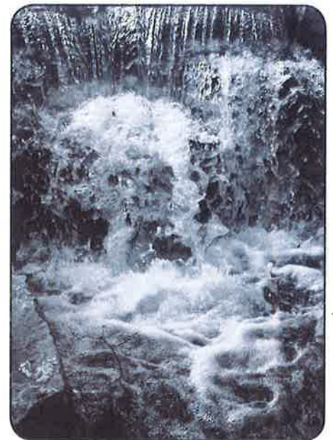
The rushing rapids of Kimball Hill > Park's picturesque waterfall.

Radioactive – Naturally occurring or the result of oil/gas production and mining.