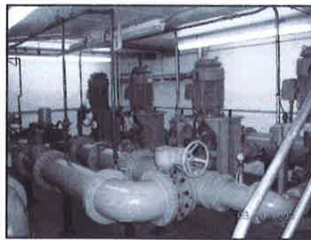
Pumping stations help Water Division employees distribute water to meet fluctuating daily consumption requirements.

Should a disruption of water flow from NSMJAWA occur, the City's water system includes four deep wells and emergency generators to ensure an uninterrupted supply of water.