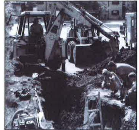
Crews replace a section of underground water main. In total, the City's system features 90+ miles of pipes that deliver an average of 14 million gallons of water to customers each week.

Since 1986, our community has been 100% reliant on Lake Michigan for treated water for daily use. Water pumped from the City of Chicago's treatment facility is delivered to Rolling