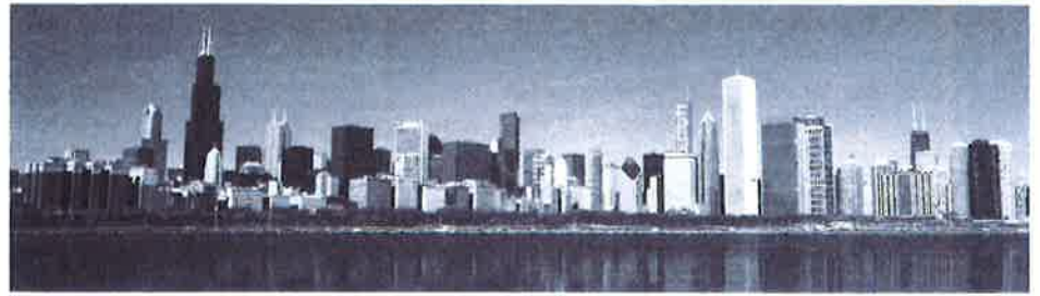
Lake Michigan has been the source of all treated water used by Rolling Meadows residents and businesses since 1986.

Some people may be more vulnerable to contaminants in drinking water than the general population. Immuno-compromised persons such as persons with cancer undergoing chemotherapy, persons who have undergone organ transplants, people with HIV/AIDS or other immune system